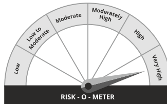
Scheme Risk O Meter

Investors understand that their principal will be at Very High Risk