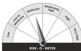
Scheme Risk O Meter

Investors understand that their principal will be at Moderate Risk